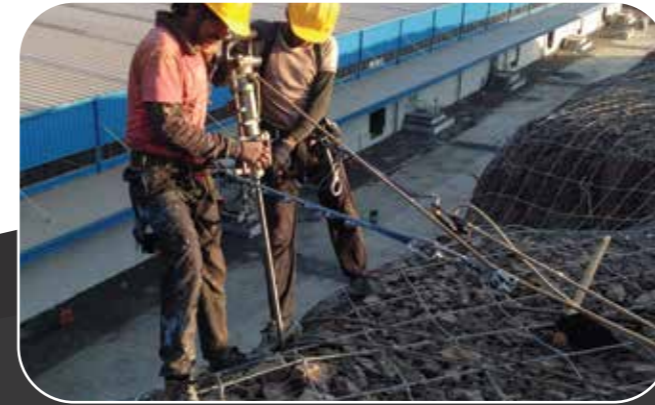
Drilling with Jack Hammer, Chakan MIDC, MAHARASTRA