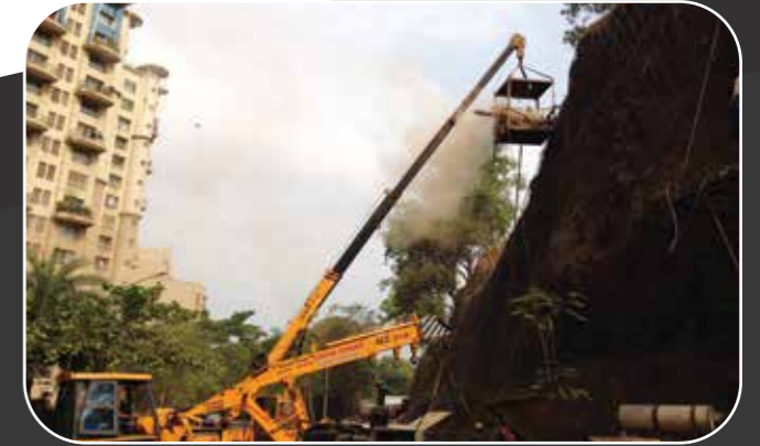
Drilling with DTH Machine, Powai, Mumbai