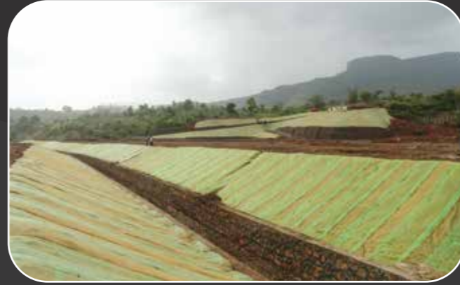
Canal Slope Protection Work Karjat, Maharashtra