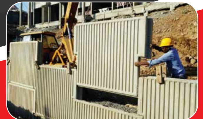
Palladium Properties, Chakan, Maharashtra