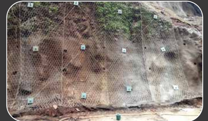
Shotcreting at Nahar Amrit Shakti, Powai, Mumbai