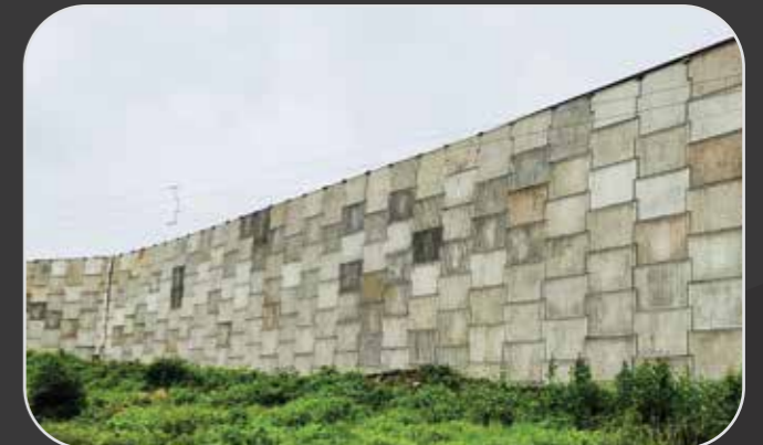
Nyati EVARA, Pune