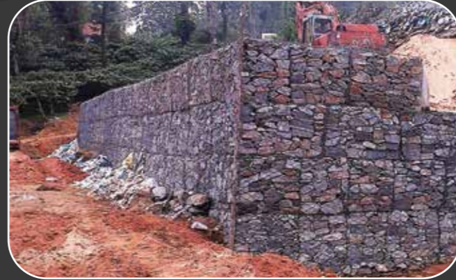
Road Embankment Retention work, for Karnataka State Highway at Madikeri