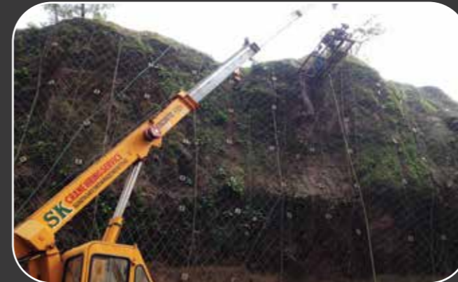
Rotary Drilling at Mumbai