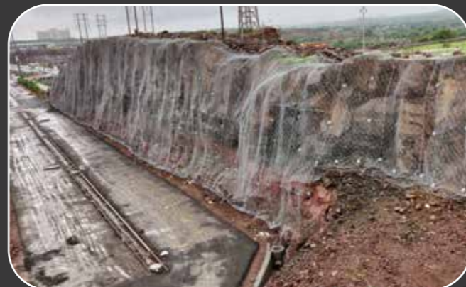
KSH Logistics & Park, MIDC, Chakan