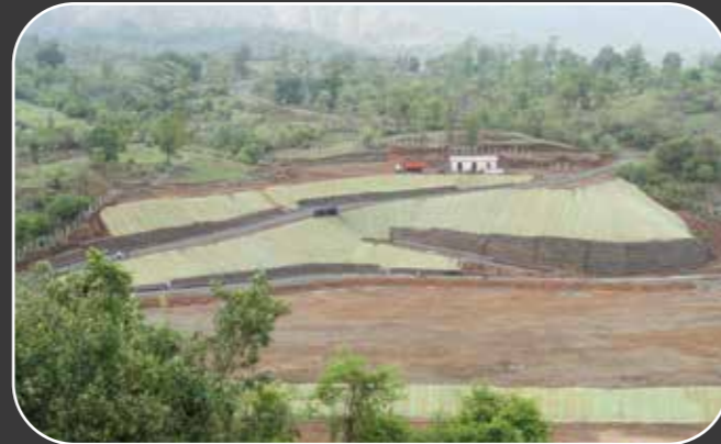
Landscaping work for Resort Project at Karjat