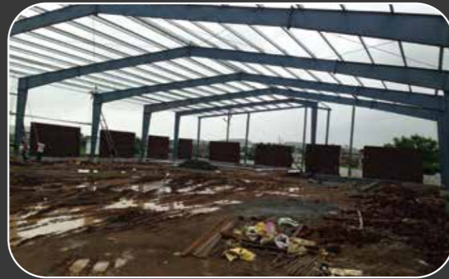
Pre-engineering Building, Apar logistics Veshvi-Uran, Maharashtra