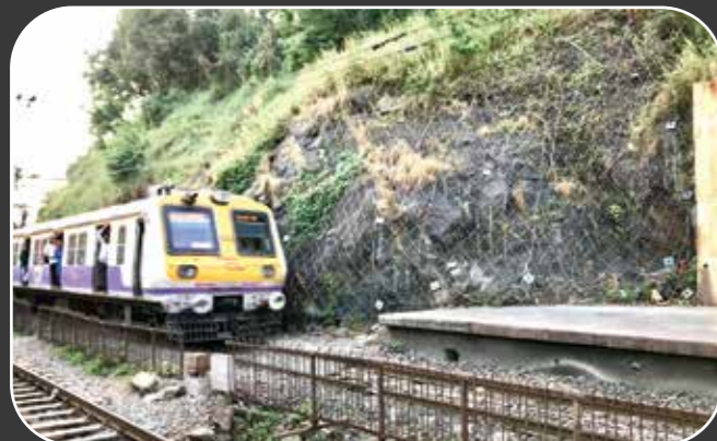
MRVCL, Dockyard road Rly Stn, Mumbai