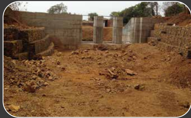
Hydraulic Application, Lonavla, Maharashtra