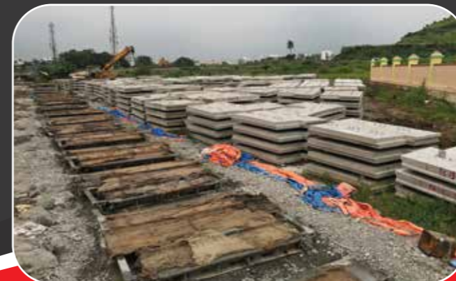
JNPT Port Connectivity, NHAJ Project