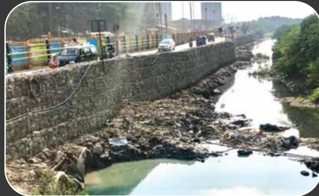
Underwater Application along Mithi River for Mumbai Metro Rail Project