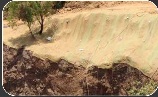
Nahar Amrit Shakti Chandivli, Mumbai