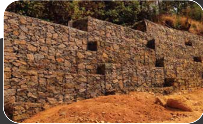
Slope Protection work, Lonavla