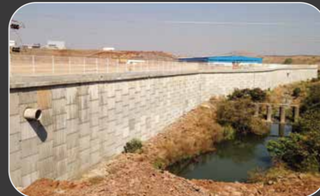
KSH Logistics & Park, Chakan, Maharashtra